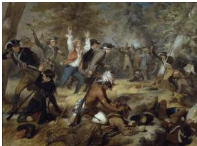
Fig. 8 – Battle of Wyoming, painted by Alonzo Chappel (1828-1887) Oil on canvas painting depicting the Wyoming Massacre, July 3, 1778.

Battle of Wyoming: June 1778, British Col. John Butler led a Loyalist (Americans loyal to Britain) and Indian force to attack Wyoming Valley, about 50 miles up the east branch of the Susquehanna River. They killed three men working at a grist mill and continued on. On 3 July the British force attacked the American militia and set up an Indian ambush. As the Americans engaged the British, the Indians attacked from the side and engaged the Americans in close combat. A bloody battle followed. Only 60 Americans escaped. The victorious Loyalists and Iroquois tortured and killed fleeing soldiers. Butler reported "227 American scalps were taken". 22 Non-combatants were spared but more than 200 chose not to surrender to Butler and fled into a swamp where women, children and old people died of exposure.