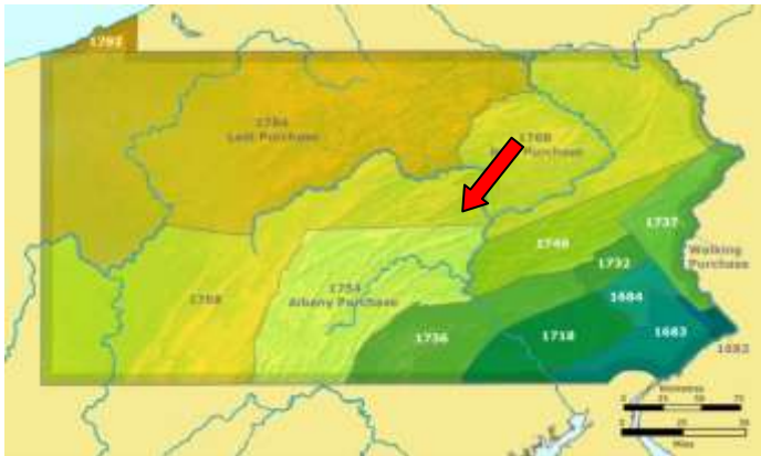
Fig. 3 - Map of present day Pennsylvania showing when land was purchased from the Indians. Yellowish section shows 1768 “New Purchase” Penn Proprietary Government bought from the Iroquois. Red arrow is location of Buffalo Valley. For better image go to: http://en.wikipedia.org/wiki/File:Pennsylvania_land_purchases.png

intended to delineate the extent of settlement and to be a buffer zone between settlers and Indians. 5