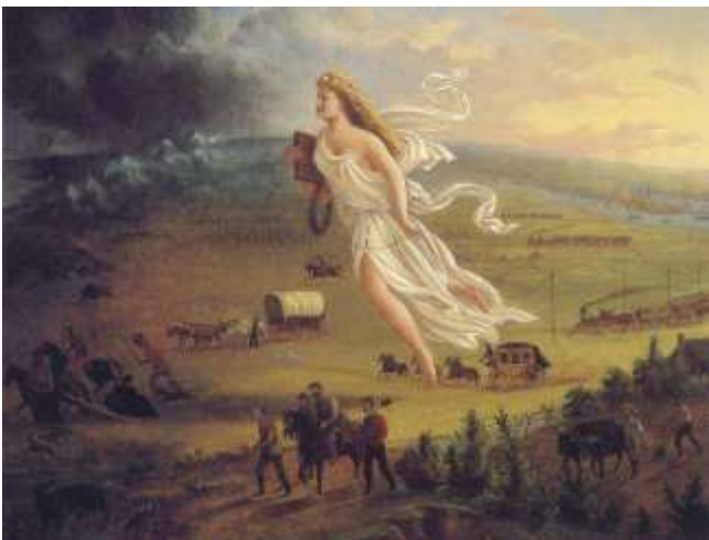
Fig. 1 - A 'period view' of settlers versus Indians. "Spirit of the Frontier" by John Gast, 1872. Settlers move west, aided by technology (railroads, telegraphs) and guided by the goddess, Columbia - driving Indians and bison into obscurity. Columbia brings "light" as she travels toward the "darkened" west. www.wikipedia.org {{PD-Art|PD-old-100}}

Settlers versus Indians: The period between 1750 and 1780 was the peak of settler pressure on Indian land in Pennsylvania. Immigrants wanted land of their own and saw the uninhabited forests as land for the taking. For the Indians this meant loss of hunting grounds, hunger and eventual displacement. To retain their way of life, the Indians had to stop the encroaching settlements and the French seemed to promise a way to facilitate this.