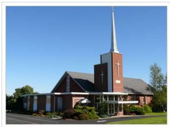
Fig. 9 – Present day Dreisbach United Church of Christ, Lewisburg, PA. http://www.dreisbachucc.org/

A log church was built in 1788 and replaced by a brick building in 1839. The church was rebuilt twice more, in 1869 and in 1964. The Lutheran congregation established its own church in 1963 at which time the union church changed its name to Dreisbach United Church of Christ. The church is celebrating its 225 th anniversary this year (2013) and invites the greater Dreisbach Family to attend the celebration.