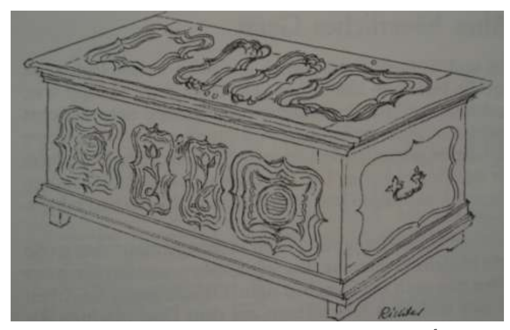
Fig. 6. Traditional chest from Balde with recessed carving.<sup>6</sup>