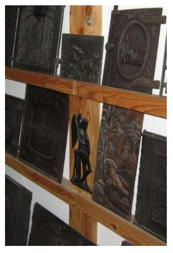
Fig. 2. Stove plates in the collection of the Erndtebrück Heimatmuseum. Many more stove plates have survived than the stoves they ornamented, as many of them are handsomely decorated in medium to high relief. This is only a small part of the Heimat-museum's collection.

The sieve and the trap would have been small items to which Simon, preparing for the most decisive journey of his life, probably gave no notice. The value of the gun barrel was perhaps in a middle range. The stove plates, and indeed the rest of the iron stove, would have been another matter, cost-wise. This could have been an upright, free-standing stove radiating heat to the room and also producing hot air that could reach an upstairs room through an opening in the ceiling. Many stoves had metal plates that were cast with skillful decorations in relief.