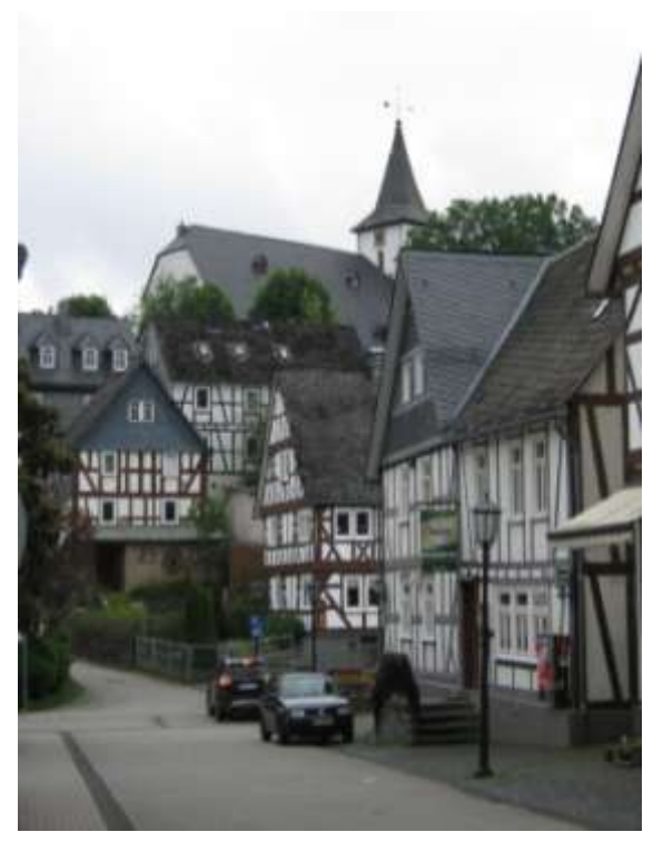
Fig. 5. This photo of "De Gasse" taken in 2012 shows little change in the historic center of Feudingen after almost four decades.